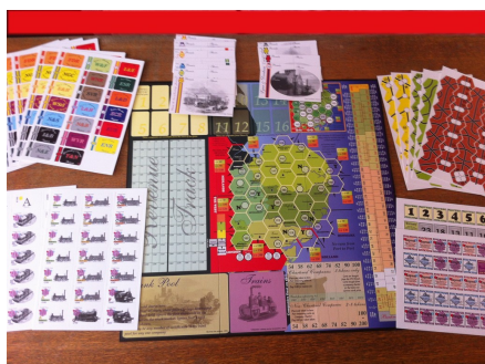
Map and Components pictured are from the 2013 LMN&B version

1862: Railway Mania in the Eastern Counties is set in this cauldron of railway construction. Players will vie to start railway companies, invest money in railway shares, and attempt to run the railways they control for personal gain, trying to keep them afloat in changeable economic times. Each game played will be unique. Out of 20 available railway companies, only 16 will be randomly selected for each game – and only eight will be available at start. Each company also starts with a randomly chosen Permit to run one of three different types of train. Players then begin the game by investing in some of the available companies. Each company will generate revenue for the majority shareholder by laying track on the board, placing station markers, running any trains it owns, paying dividends or retaining revenue from those trains, and then buying more and more advanced trains. As the game progresses, players can start more companies and can merge companies they control with other companies. When larger and more powerful trains are bought, older trains become obsolete and disappear, causing financial crisis for the unprepared. The game ends after the last band of trains is bought, and the wealthiest player, including shares, but not money in companies, is the winner.