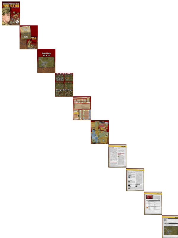
Core Game, Lock 'n Load Tactical system - first days of World War III.